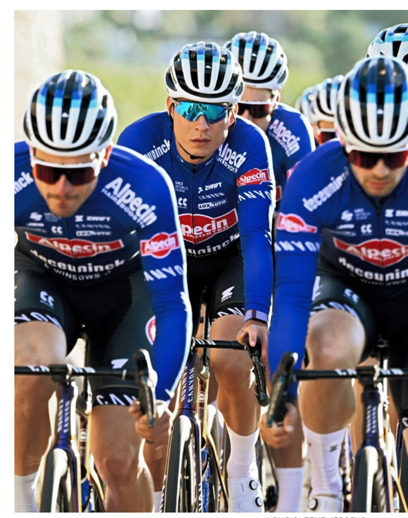
LONG SLEEVE JERSEYS

When the temperature drops, a long sleeve jersey can be the ideal alternative to ensure you maintain a comfortable temperature on your rides. From our PRO and ELITE collections, these close-fitting jerseys are made from insulated and elastic fabrics with brushed fibres on the inside for extra warmth and comfort. In the OFF-ROAD section you will find options for BMX, MTB and gravel riding.